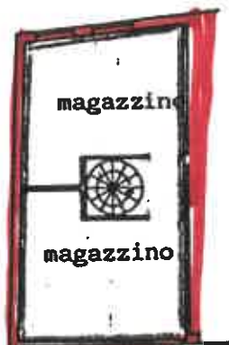
PIANO PRIMO SOTTOSTRADA